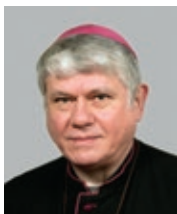
Auxiliary Bishop Msgr. Václav Malý (1997)