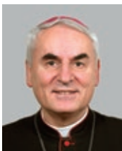
Diocesan Bishop Emeritus Msgr. Vojtěch Cikrle 13th Bishop of Brno (1990)