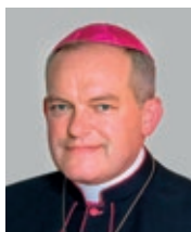
Archbishop Msgr. Josef Nuzík 15th Archbishop of Olomouc (2024)

The Diocese of Olomouc, as a continuation of the Moravian archdiocese of St. Methodius from the year 869, was established in 1063 by Pope Alexander II on territory appropriated from the Diocese of Prague. Pope Pius VI elevated the diocese to the status of archdiocese by bull of 5 December 1777. The Archdiocesan Centre for Family Life offers help to families in all 21 deaneries. The archdiocese publishes a magazine called Oldin - the Olomouc archdiocese informer.