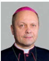
Auxiliary Bishop Msgr. Zdenek Wasserbauer (2018)