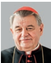
Archbishop emeritus Cardinal Dominik Duka OP 36th Archbishop of Prague (2010)