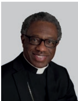
Apostolic Nuncio in the Czech Republic H.E. Msgr. Jude Thaddeus Okolo

The apostolic nunciature is a diplomatic mission of the Holy See in individual countries.